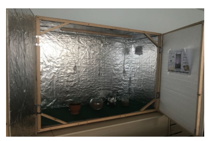
Figure 3: GrowBox.

As a result, ideal conditions are created, such as adjustable temperature, humidity and lighting, which contributes to growth. The Arduino platform was used to automate the project.